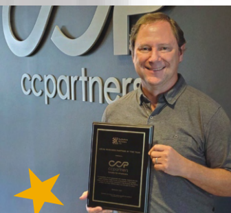
Local Business Partner of the Year Crawford Chondon & Partners LLP