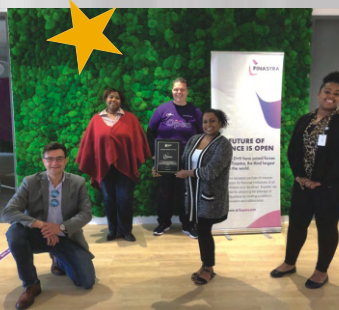
Corporate Partner of the Year Finastra