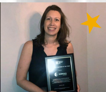
Community Partner of the Year Scientists in School

Congratulations to all our volunteers, donors and community partners for making an incredible impact!